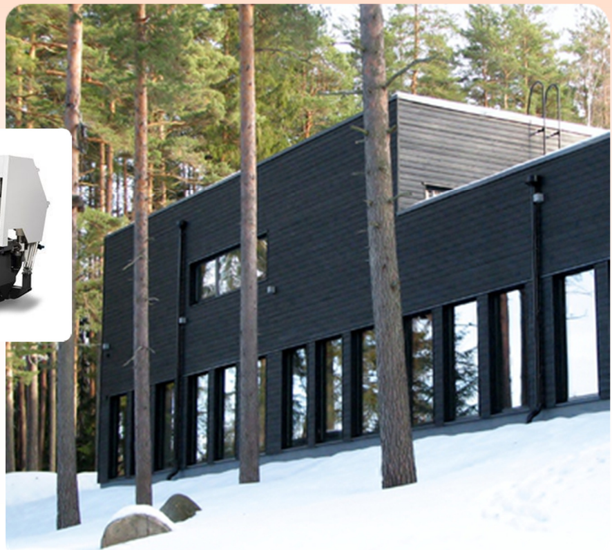
Photo: Kubija Hotelli SPA building, Võrumaa, Estonia

See more on our web-page: www.puidukoda.eu/en/references